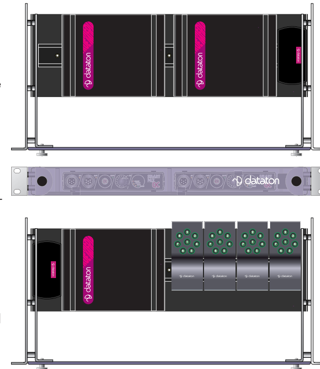
Top: Rack mount with two SMARTPAX QC and a 12V DC ADAPTOR.

When you are satisfied that the installed units are working correctly, screw the smoked glass front into place.