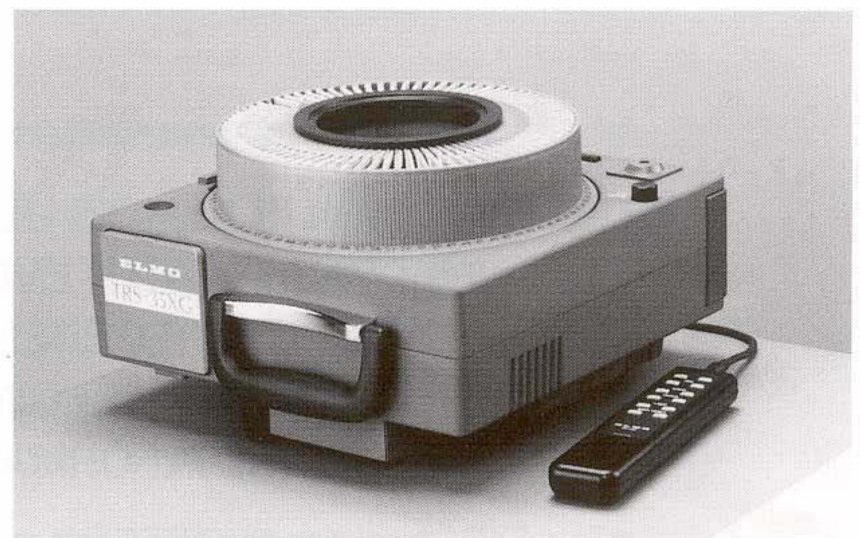
High Resolution Slide Film Presenter TRS-35XG XGA resolution of 1/3" 850,000 pixels CCD